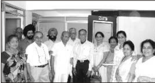
Rotarians & IW Members at the Camp

Free medicines for 3 days were distributed to the patients by various pharmaceutical companies.