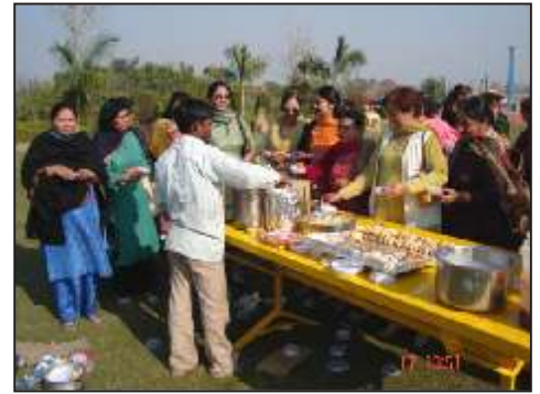
..... and the Gol Gappas