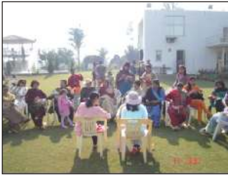
Annas busy with Tambola.....