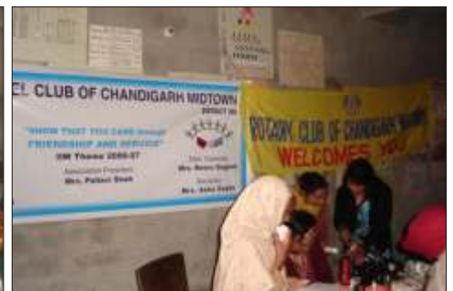
Free medicines & treatment