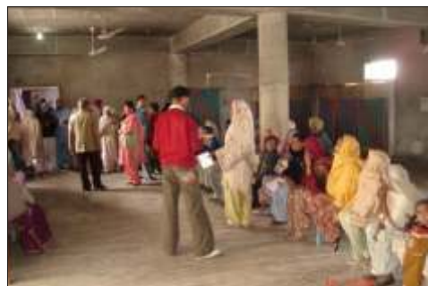
Patients pouring in at the camp

Rotary Club Chandigarh Midtown, in collaboration with Rotary Club of Wollaton Park, Nottingham, UK, organised a free Eye Check - up Camp which was held at Khuda Ali Sher on 10th March, 2007 with the assistance of Inner Wheel Club Chandigarh Midtown and the Youth Club of Khuda Ali Sher.