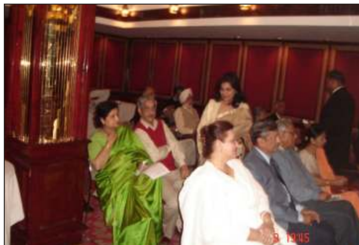
Rotarians & spouses enjoying the proceedings