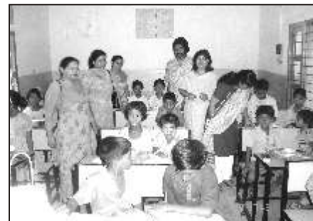
Distribution of clothes and refreshment to the children at Sarangpur

It is an exciting time when the relatives visit us from USA! It is such fun to open their large, oversized bags and shout with joy and wonder as the goodies are handed around. But, this week, when my sister Sunita visited us, it was different.