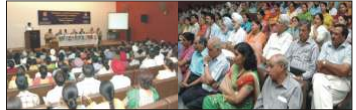
Rotarians, Guests & School Children