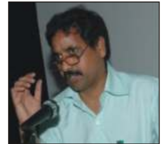
DPI(S) SK Setia