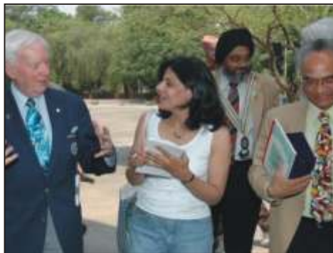
Chat with the Press