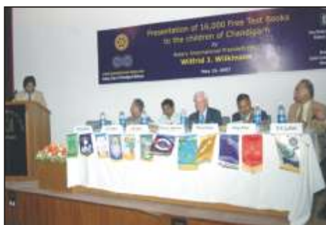
The meeting begins with welcome address