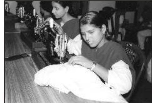
Visually Challenged Boys and Girls being imparted Vocational Training at the Institute

Students are encouraged to earn while they learn. They are taught traditional crafts like preparing floor dusters and table dusters of khadi, wax candles during festival days, caning of chairs, etc. The amount received from the sale-proceeds of these dusters, candles, chairs, etc. is deposited in their personal saving bank accounts. Every student, when he / she passes out of 10+2 class, has normally saved about Rs. 14,000/- to Rs. 15,000/- in this way. Besides this, every student gets two free uniforms in a year including Braille watches & educational material. Mobility & Orientation training is provided to both boys & girls students by trained instructors. Students can independently move around with the help of 'white cane' (stick) after this training.