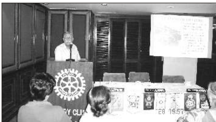
Guest Speaker makes his presentation.....

A visually challenged person can read your mind better than you could read his. They are as productive as any normal person. The Government has 1% job reservation for these persons but ironically, this is not being strictly followed.