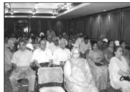
..... the audience listens with interest.

The General gave a very informative talk followed by an eye opening presentation on "Blindness in India" and "Institute for the Blind". He said 2% of India's population is blind and this figure is increasing with the population. The blind are now known as 'Visually Challenged' to make them socially acceptable. These persons are very intelligent, develop a sixth sense with a sharp memory & have self respect. They don't want to be treated as inferior to anyone else. They want :