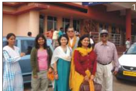
Welcome at Bhubneshwar