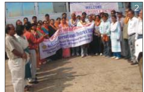
Hosts and Visiting Rotarians