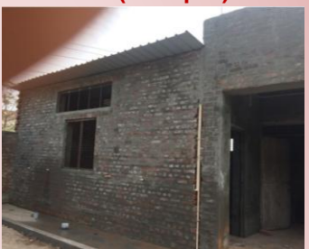
Construction work for our signature project Rotary Sarai, GMCH-32