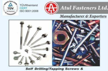
Self Drilling/Tapping Screws & Special Purpose Fasteners

86, Industrial Area, Phase-1, Panchkula-134 109 (Haryana) Ph.: 0172-2565825, 2561543 Email: dr.keshogupta@itclabs.com Website: www.itclabs.com