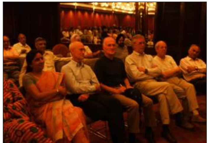
Rotarians listening 'fresh ideas' with rapt attention.