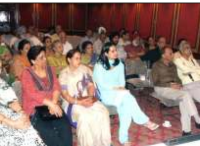
House Full !