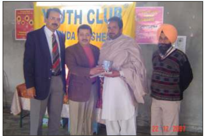
One Kg. Desi Ghee for the Donor