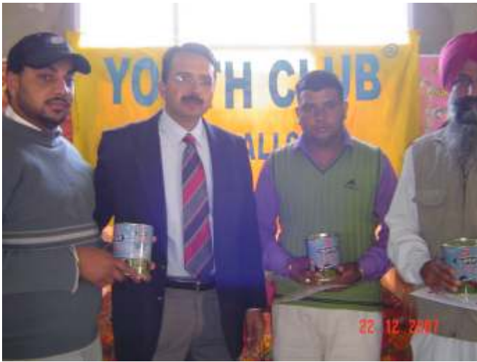
Club President with Blood Donors

medical staff of Sector 16 Multi Specialty Hospital were doing their job meticulously.