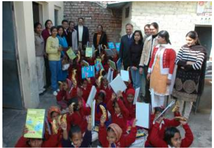
Rotaractors with Jagatpura Students & Rotary Club President