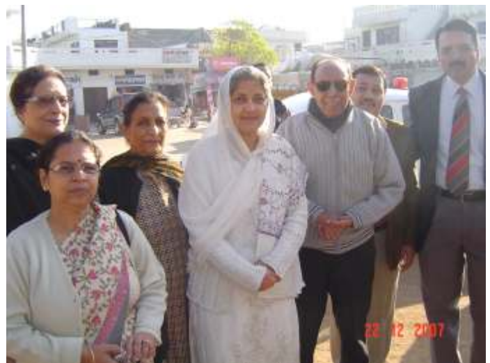
Mayor with Rotarians & IW Members

The Mid Towner wishes the Readers a Happy New Year 2008.