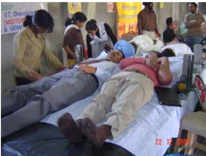
Blood Donation in progress