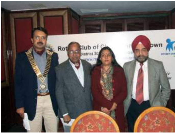
Current President & the Incoming Presidents with Club Election Chair