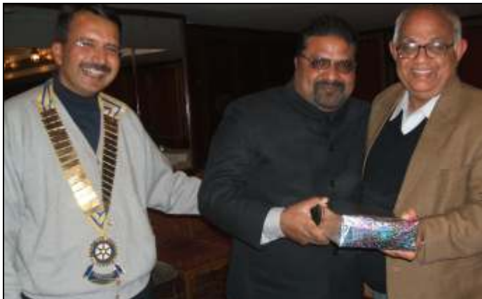
Memento for the Winner of Punctuality Draw