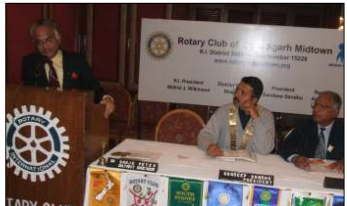
The Distt. Governor - Allocation of Responsibilities