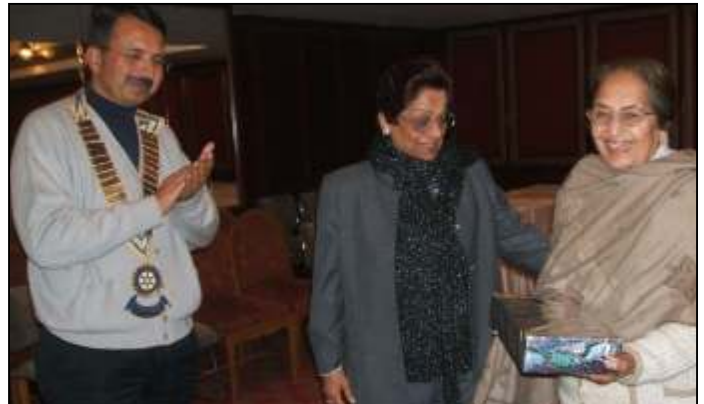
Memento for the Happy Birthday Girl