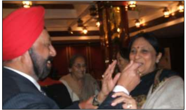
Happy Homecoming Cake