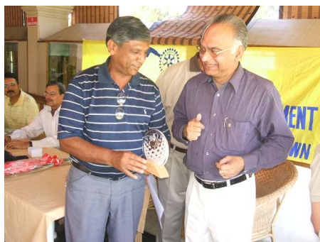
DG to PDG - congrats for 2 prizes