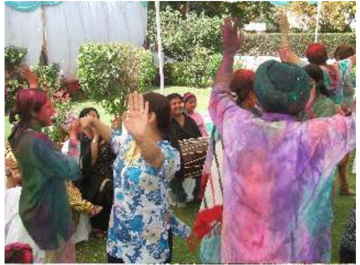
Colours all over