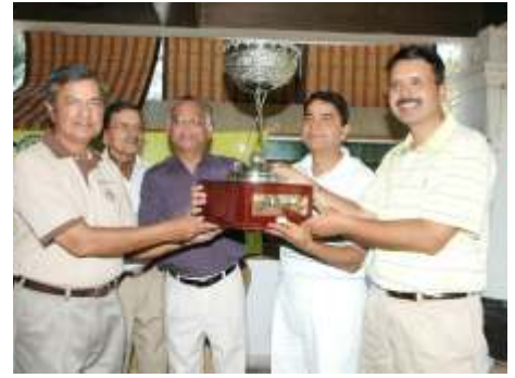
Team Event Winner

many individual prizes and chocolates to encourage the participants.