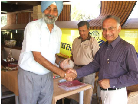
Nearest to the pin