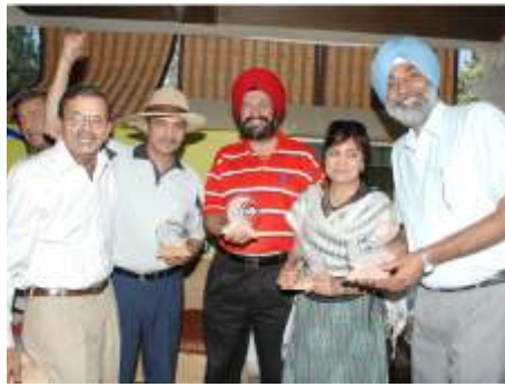
Team Event Runner up