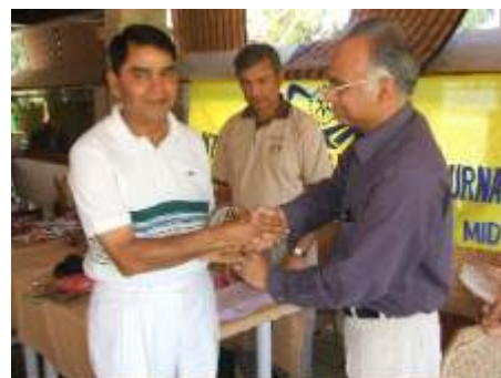
Individual event recipient