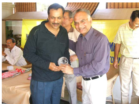
Individual event recipient