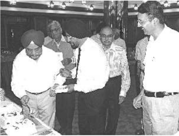
Birthdays & wedding anniversaries celebrated ..... in absence of concerned persons!

other meditation techniques, systems of stress reduction, or programs available for personal development.