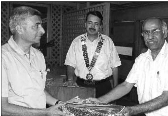
Gift for the Punctuality Draw Winner