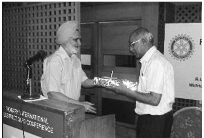
Memento for the Guest Speaker

wounds and this is best done by a sharp saw that may be manual or engine driven. He said that to get a clean cut, start from the underside and complete the cut from the upper side.