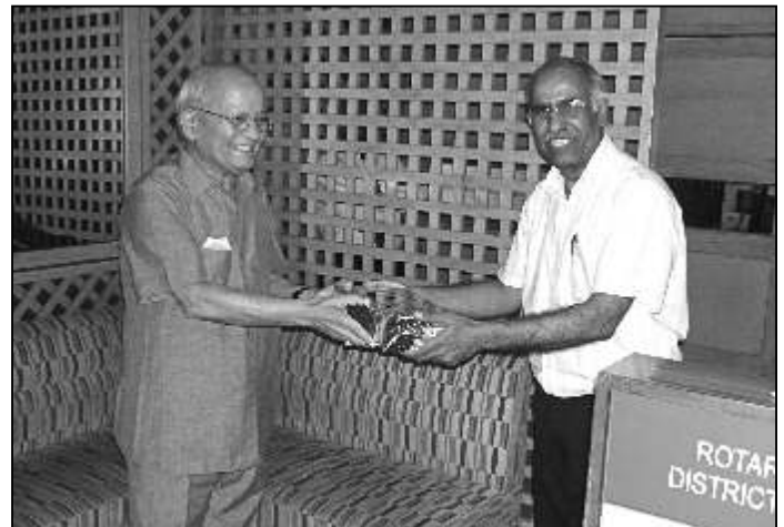
Gift for the Happy Anniversary Boy