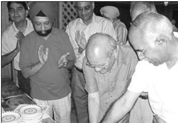
Happy Anniversary Cake

He also showed pictures of badly damaged trees by the nails stuck into the trees to fix sign boards and banners, and advised that we must not stick nails into the trees. There were more pictures of trees badly damaged and disfigured while pruning or cutting branches in a wrong manner. He advised that cutting unwanted limbs of trees should ensure a neat cut with no remnant