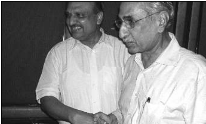
Gift for Punctuality Draw Winner

There are new entrants into the outsourcing destinations. Vietnam, Korea, China and the countries of Eastern Europe are posing challenge to the export of IT products from India. Canada is already a major player in this game due to its proximity to USA and its very good educational system.