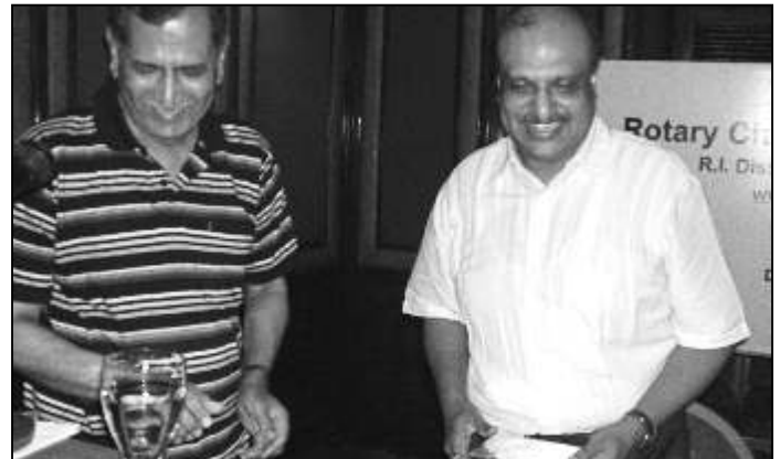
Memento for the Guest Speaker