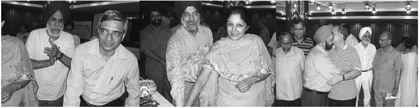
The Happy Cakes

admission of the growth, efficiency and reputation of the Indian companies in this field.