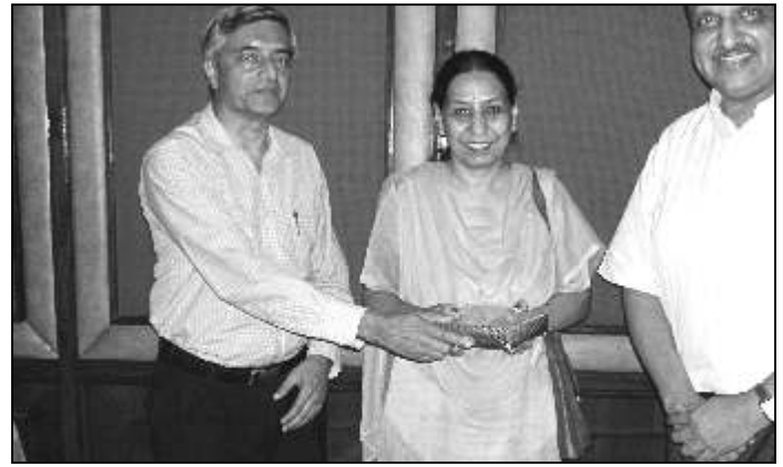
Gifts for the Happy Anniversary Couples