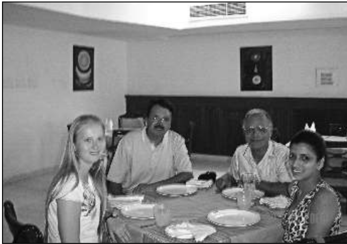
Lunch at the Golf Club, Chandigarh