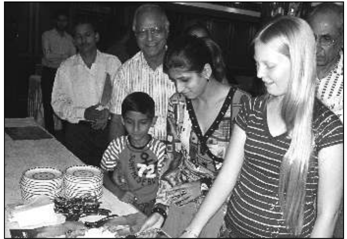
The Happy Cakes

Youth Exchange Programme. He is the District Chair Youth Exchange Programme.