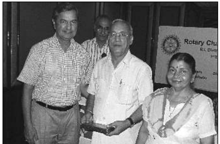
Memento for the Happy Anniversary Couple