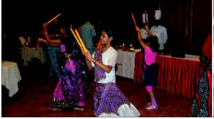
Children Performing Dandiya