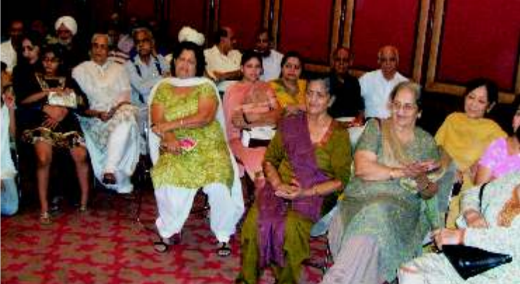
The Enthralled Audience

occasion than the elders, as their dresses were traditional.