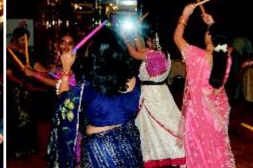
Anns & Ladies dance with full enthusiasm - the true spirit of Dandiya