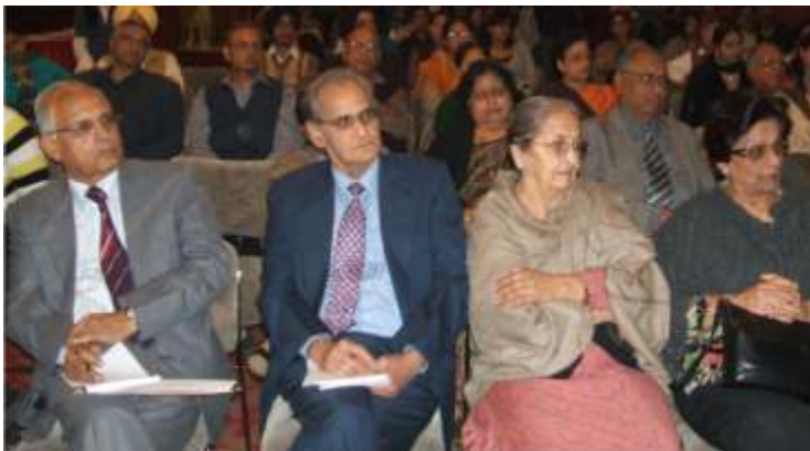
The audience listens with rapt attention