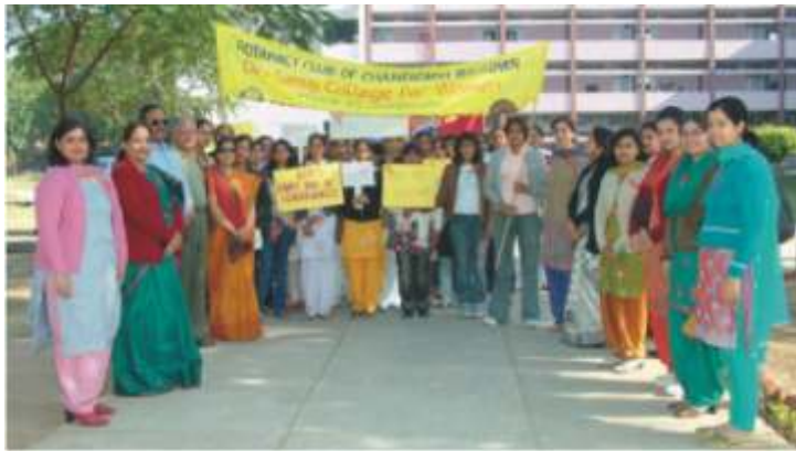
Rotaractors all geared up for the Flag off

The Rotaract Club of Dev Samaj College for Women, Sector 45 B, Chandigarh in association with Red Ribbon Club observed the World Aids Day on a solemn note by observing silence in tribute to the martyrs and innocent lives lost in Mumbai Terrorist Blasts. There was an enthusiastic response by the students to participate in the AIDS Awareness rally as they painted their faces with the insignia of the