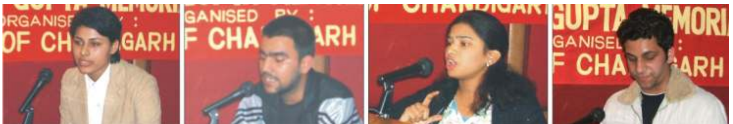
The Participants speak their minds out