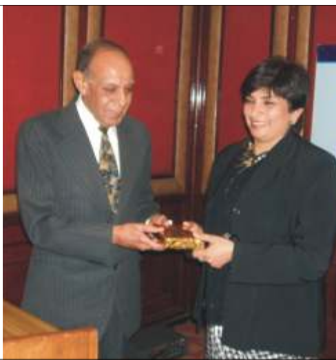
Memento for the Guest Speaker