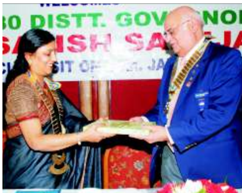
Presentation of mementoes to the DG and the First Lady