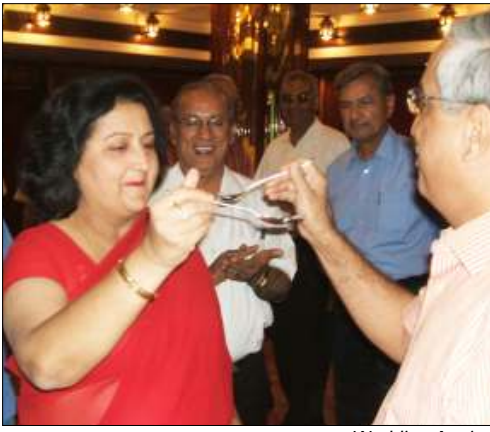
Wedding Anniversary Celebrations