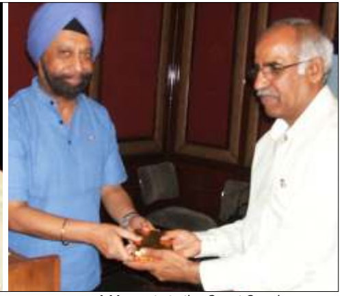
A Memento to the Guest Speaker

and then start cutting it from above allowing both the cuts to meet midway. Care should also be taken to control the white ants, mealy bugs and other such insects.