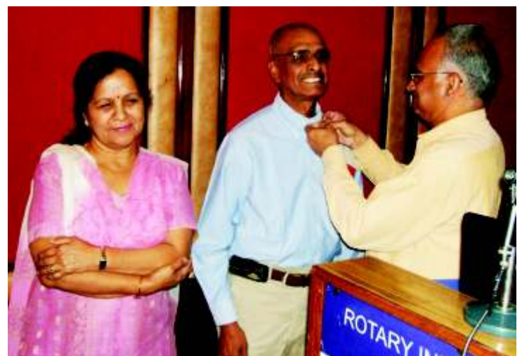
IPDG Shaju inducts our new Member

Other major mistake is done by cutting the limbs from above in one go. As the head of the limbs are heavy due to leaves and branches, they break even when we are midway dragging the bark, causing immense damage to the tree. For this, one should give one-third cut to the limb from below