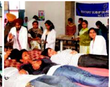
seen motivating the students to donate blood and appreciate the efforts of members of Rotaract Club of Dev Samaj College