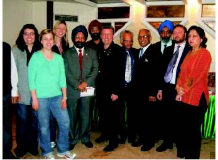
GSE Team from District 5810 and Rotarians of District 3080