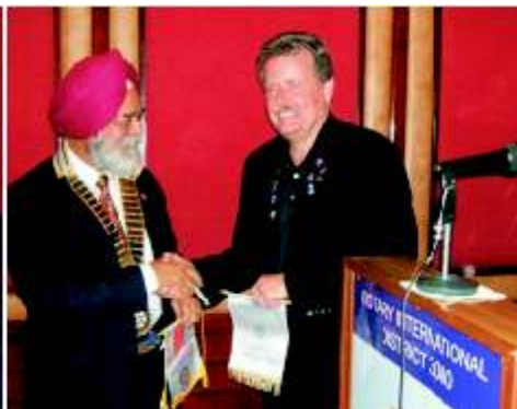
Exchange of flags: Addison Rotary Club and Rotary Club Chandigarh Midtown