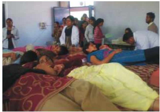
Students of Dev Samaj College donate blood, while doctors & staff of GMCH perform their duty for a noble cause