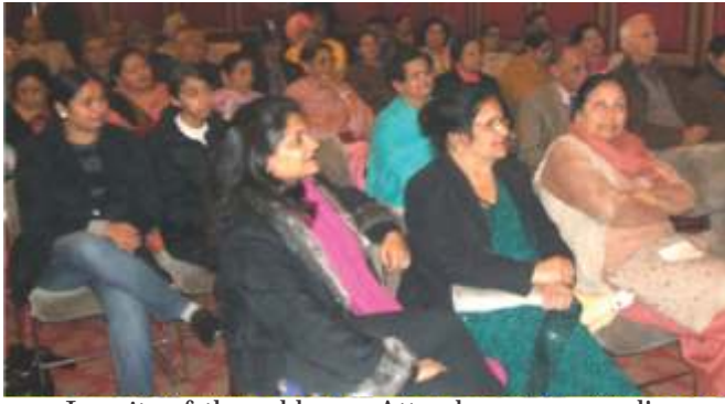
In spite of the cold wave Attendance was good!