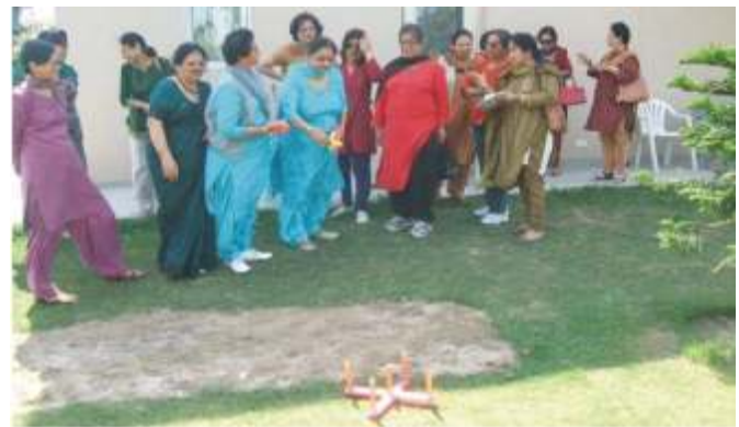
Putting rings around the 'wickets'