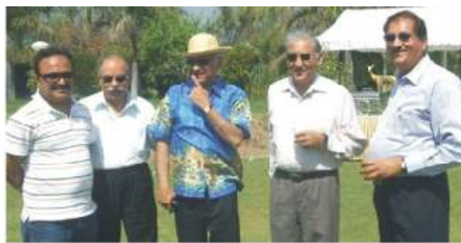
Not a cricket match but Rotary fellowship