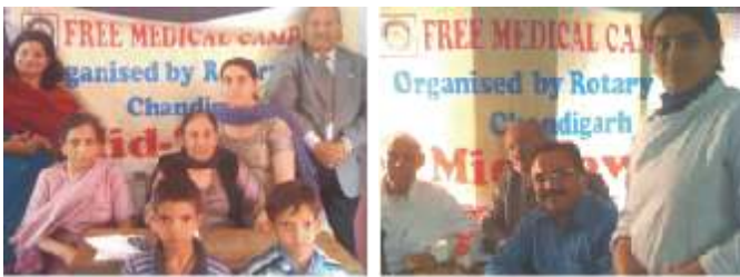
Rotarians at Sarangpur Night School Medical Camp