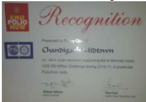
Recognition to our club for 100% club members supporting Bill & Melinda Gates US $ 200 Million Challenge during 2010-11 to eradicate Polio from India