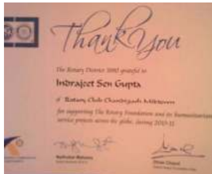
PP Rtn. Indrajeet Sengupta for supporting TRF and its humanitarian service projects during 2010-11