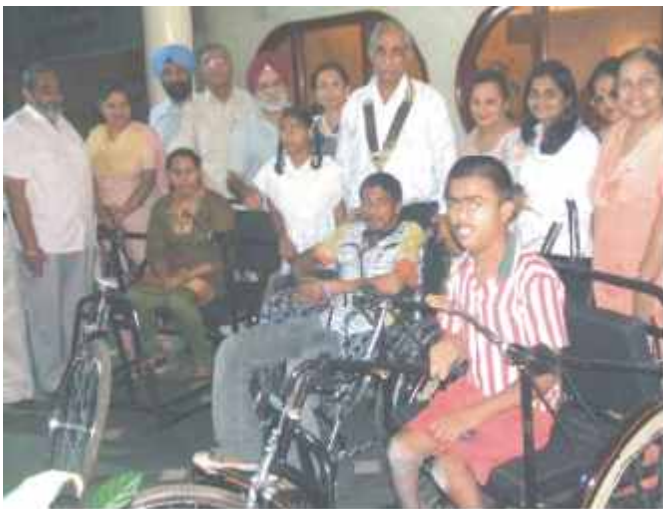
Beneficiaries of tricycles and wheel chair with Rotarians