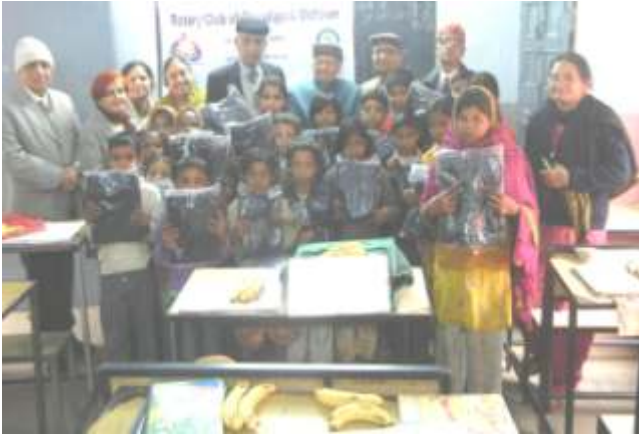
Rotarians with students holding on to their sweaters