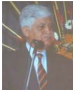
General V.P. Malik Former Army Chief