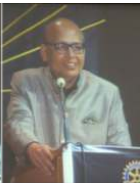
Dr. Abhishek Singhvi