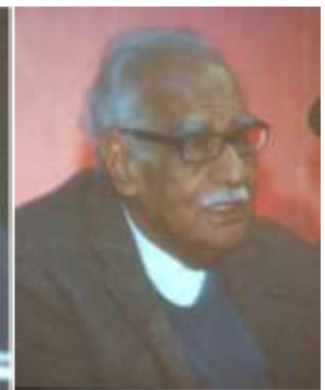
Mr. Kuldip Nayyar