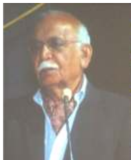
Dr. B.N. Goswamy Shreyas Award

Dr. B.N. Goswamy is a legend of our time whose pioneering research in the field of Indian art is exceptional, providing insight and interpretation into its finer nuances for art connoisseurs and academicians worldwide. He had a brilliant academic career, topping the University right from his