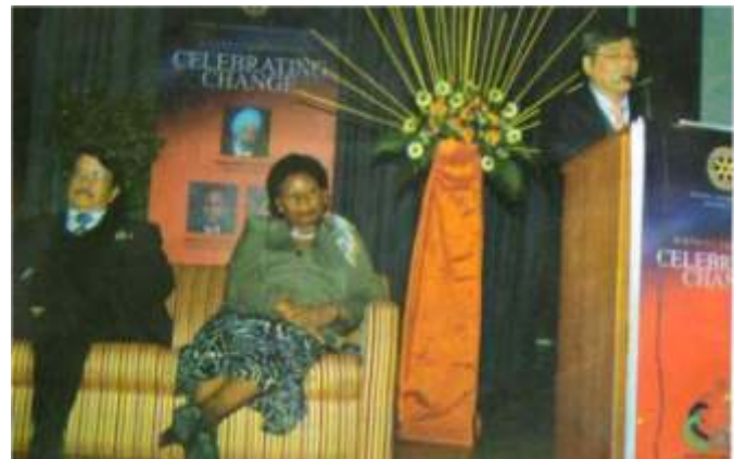
Peace is for better life for future generations, say the Envoys

of Argentina to India, remarked that efforts for peace amongst