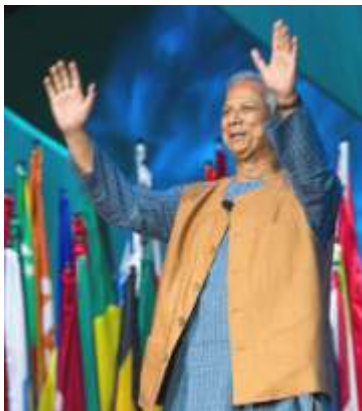
Dr. Muhammad Yunus, Nobel Peace Prize laureate