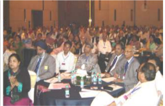
The auditorium in JW Marriott Hotel was full of Rotarians from all over India