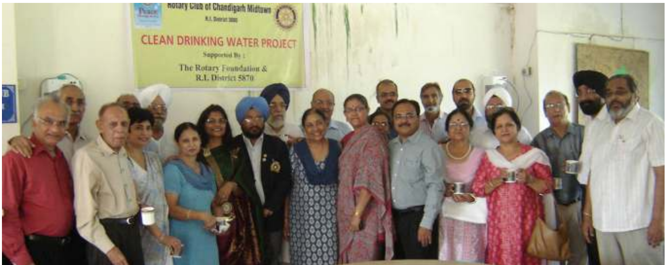
Clean Drinking Water Project of our Club at Sikhya School