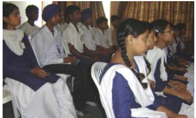
Members of Interact Club of Sikhya School