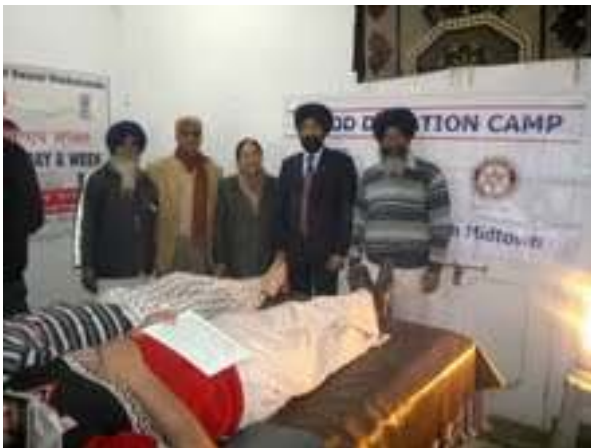
Blood donation camp at Khuda Ali Sher

Blood Donation Camp was held jointly by our club, Rotary Community Corps (RCC), Youth Club, Nehru Yuvak Kendra and Panchayat at Khuda Ali Sher on 20 th January 13. Women and young boys of all communities of this village participated in this blood donation camp with full enthusiasm between 9 AM to 1.30 PM.