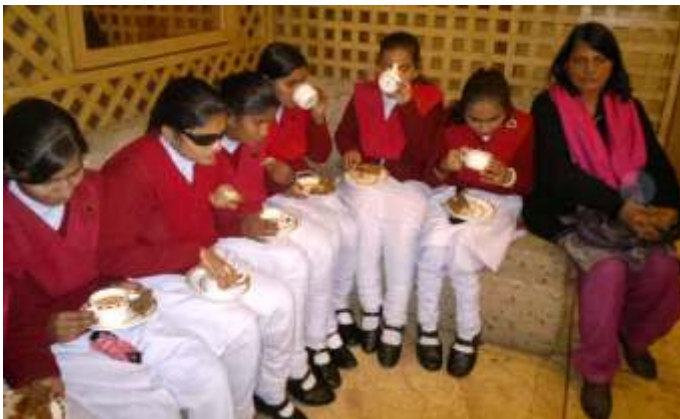
Students from Blind Institute entertained us with excellent performance of patriotic songs

PDG Shaju Peter who is also on the organizing committee of forthcoming Rotary South Asia Summit to be held at