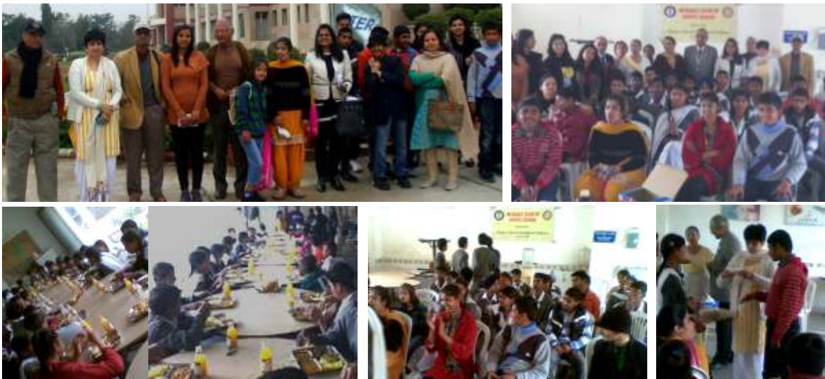
Rotarians, Inner Wheel members and Rotaractors participate in a meaningful project with Interact clubs