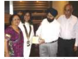
Urmil & IPP RK Luther