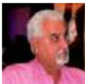
PP Subhash Bindra