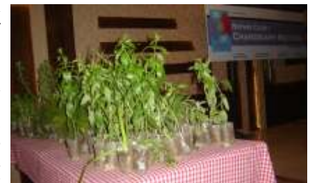
Herbal plants on display

Om Parkash concluded with an 'important caution' that all these plants should be used in consultation with Doctor. This was also