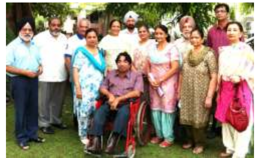
Members of Cheshire Homes attending AGM