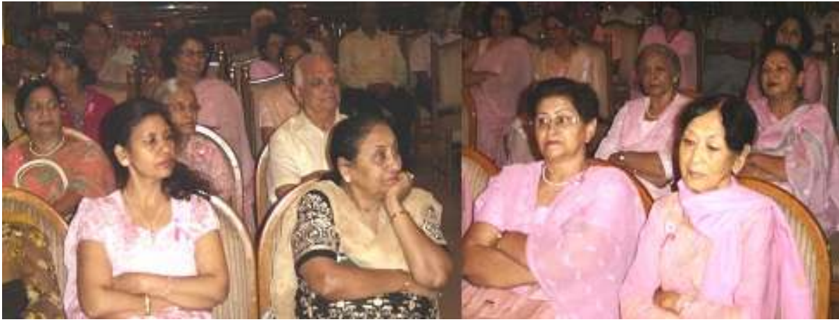
Ladies in Pink!