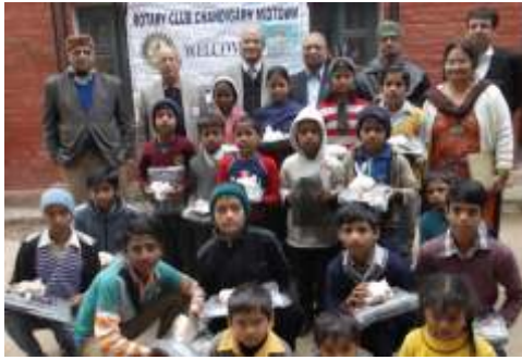
Lohri celebration in Night School