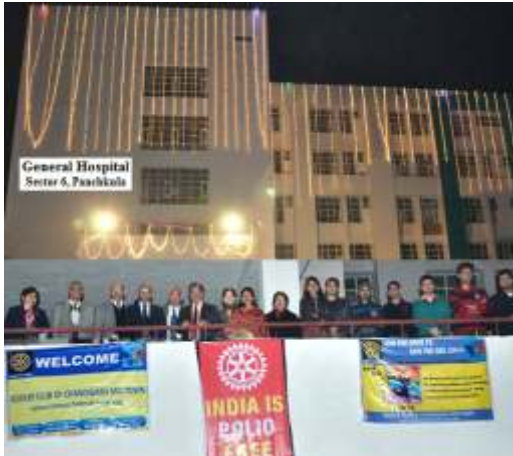
Rotarians, Rotary Anns and Rotaractors of Chandigarh Midtown in illuminated building of General Hospital, Panchkula

On January 13, 2014, when India completed three years of no polio case detection and was declared Polio Free by WHO, Rotary International celebrated this special moment by illuminating public buildings all over the country. The partners in polio eradication, the Rotarians have achieved the impossible task. The building of General Hospital, Sector 6, Panchkula was illuminated at 6:00 p.m. to commemorate this special moment of victory of our war against polio.