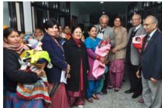
Rotarians of Chandigarh Midtown with new born babies in General Hospital, Panchkula