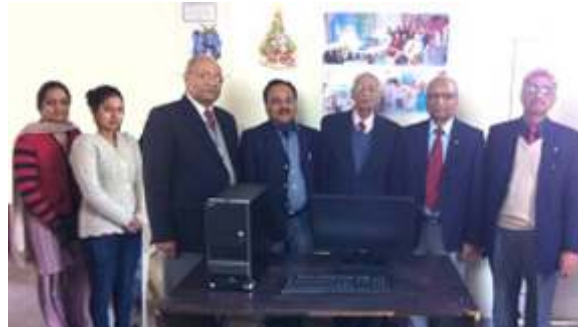
Computer for Home Care Nursing