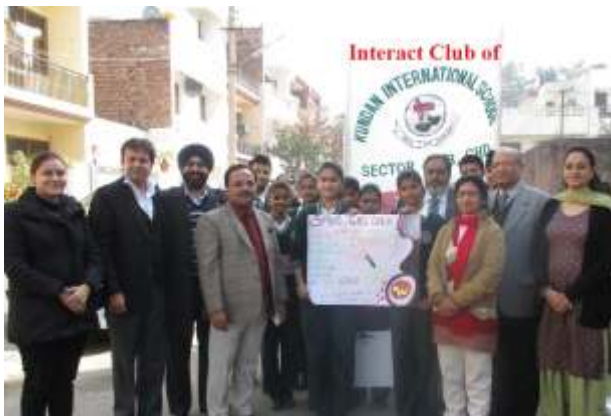
Rotarians join the staff and Interact Club of Kundan School to promote our campaign, 'Save the Girl Child'