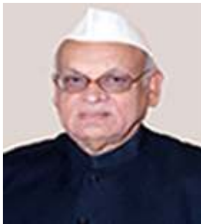
H.E. Dr. Aziz Qureshi, Governor of Uttarakhand 'declares war' against poverty and hunger