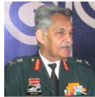
Leading from the front! Lt. Gen. Anil Chait highlights strong will of the Indian Army for serving in the hour of need in Uttarakhand disaster