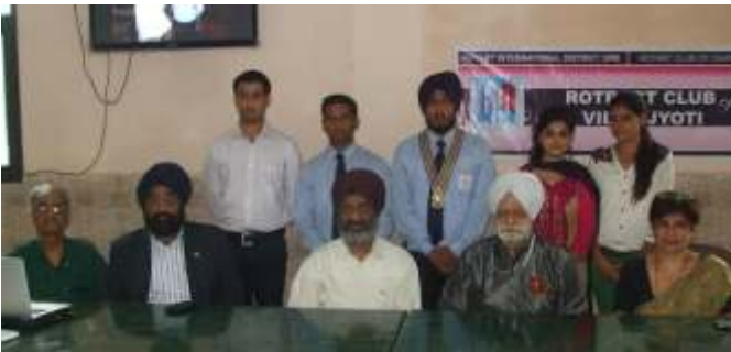
Rotarians and team 2014-15 of Rotaract Club of Vidya Jyoti