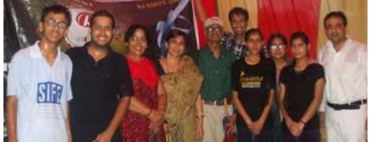
Heavy rainfall cannot dampen our activities as Rotarians and Rotaractors serve in the slum areas in Bhaskar Colony