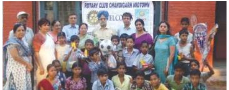
Diwali Celebrations with students of Night School, Sarangpur