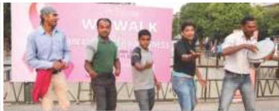
Nnkud Natak staged at Plaza to spread awareness