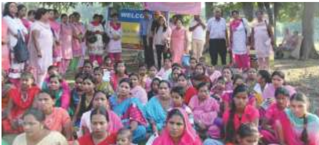
Diwali Celebrations with adult students