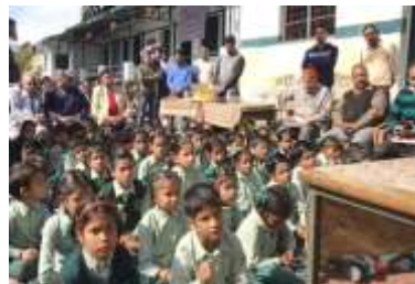
The handing over function

All the schools have been provided with school desks and benches for the students. The school compound has been provided with a solar street light as well. Six more schools are under construction and will be ready for handing over in the month of December 2014 followed by another six schools in April 2015. Speaking on the occasion PRID Rtn. Y.P. Das, Trustee of Rotary Uttarakhand Disaster Relief Trust mentioned that more schools will be constructed both in Rudraprayag