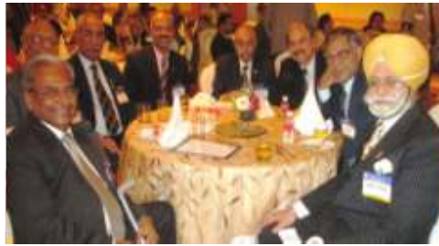
Rotarians of our club enjoying the fellowship. Wah Taj...!