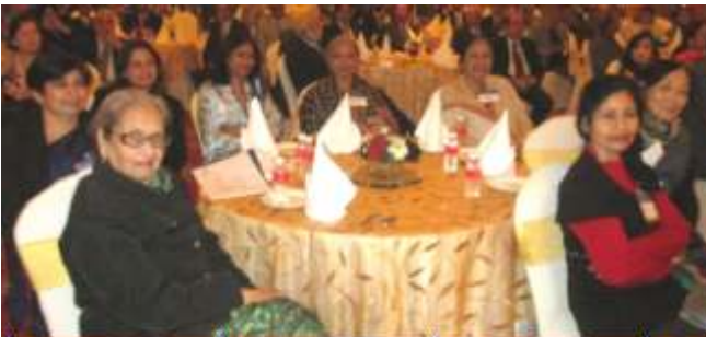
Rotarians and R'anns of our club