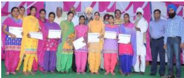
Certificates to 16 girls for completing computer course