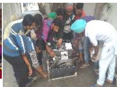
Refrigeration program at Burail