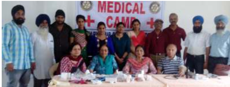
Rotarians, doctors and RCC members