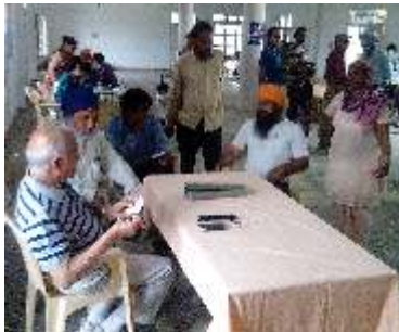
Patients being examined