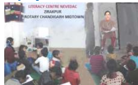
Literacy Centre at Zirakpur