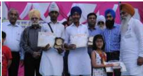
Mementos to winners of drawing competition

Vocational Centre, Khuda Alisher run by our club. We also presented mementoes sponsored by our club to winners amongst 150 school children who participated in drawing competition held on 23 rd March 2015.