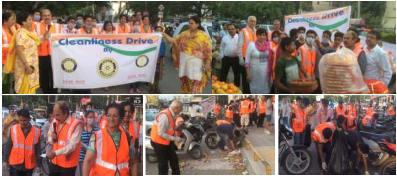
Successful drive to create public awareness on 'Clean India'