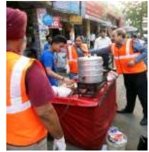
Rotarians and Interactors promote cleanliness in market and public places resulting in 80% success rate